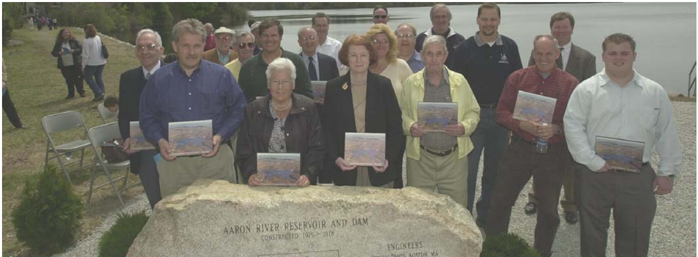
Recipients, Water Department Certificates of Appreciation - 25 th Anniversary, Aaron River Reservoir, May 11, 2003