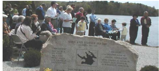
25 th Anniversary – Aaron River Reservoir – May 11, 2003

To ensure that tap water is safe to drink, the DEP and EPA prescribe regulations which limit the amount of certain contaminants in water provided by public water systems. The Food and Drug Administration (FDA) and the Mass. Department of Public Health (DPH) regulations establish limits for contaminants in bottled water which must provide the same protection for public health.